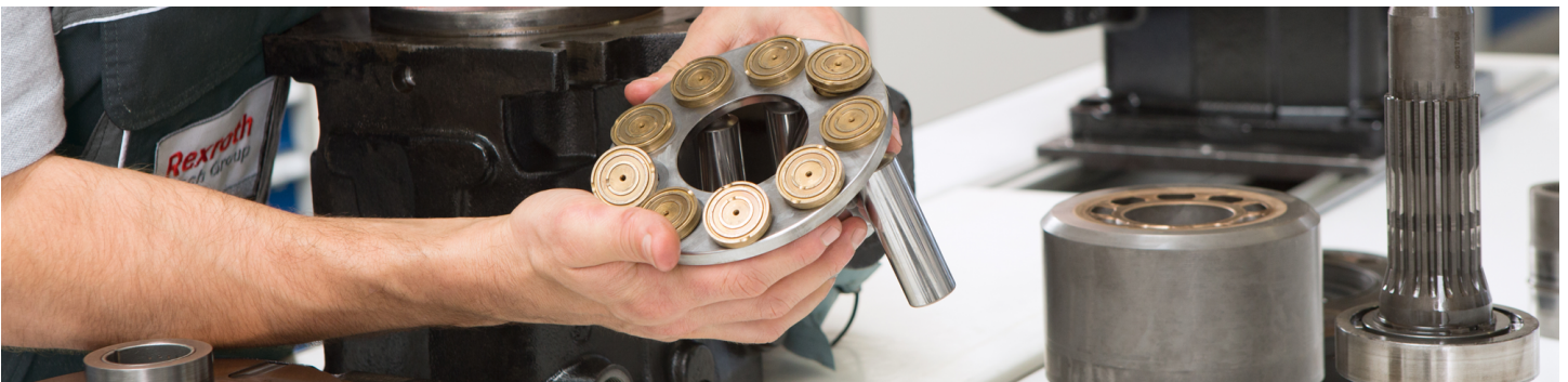
Service & Repair